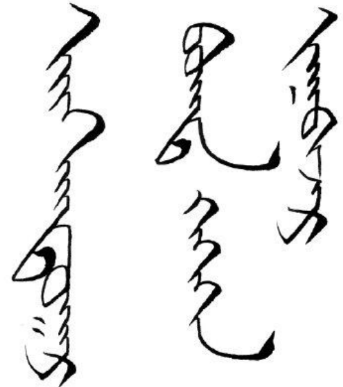
First Bogd Gegen - Zanabazar